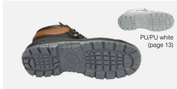
PU/PU white (page 13)