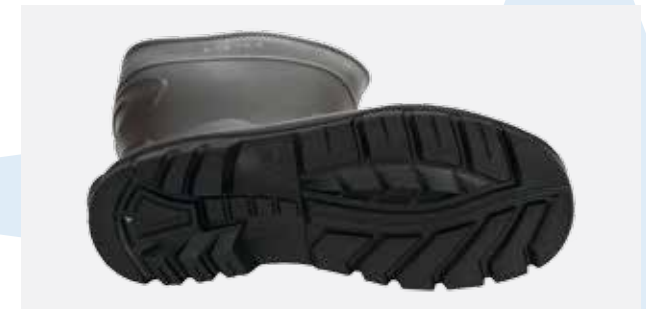
Polyurethane boots, premium serie (page 19)