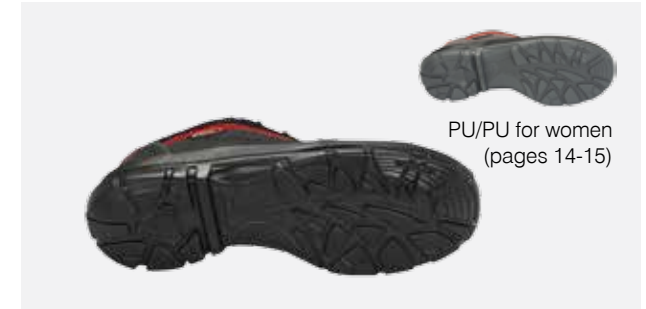
PU/PU for women (pages 14-15)