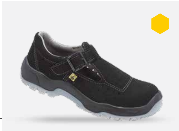
Model 601 (for men) PN-EN ISO 20345, S1, SRC, ESD