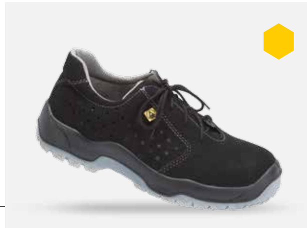
Model 602 (for men) PN-EN ISO 20345, S1, SRC, ESD