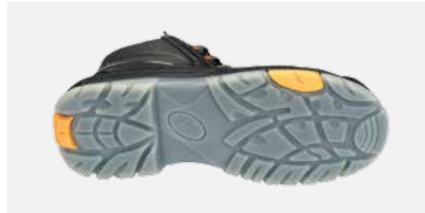
PU/TPU for men (page 8) PU/PU for men (page 9)