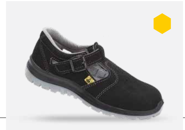
Model 651 (for women) PN-EN ISO 20345, S1, SRC, ESD