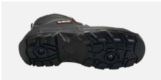
PU/Rubber for men (page 17)