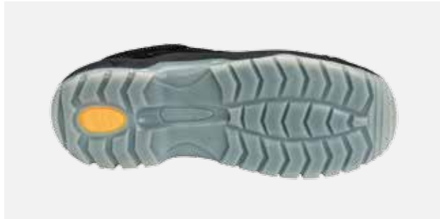
PU/TPU for men (pages 5-7)