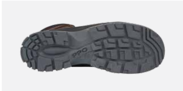
PU/PU for men (page 4)