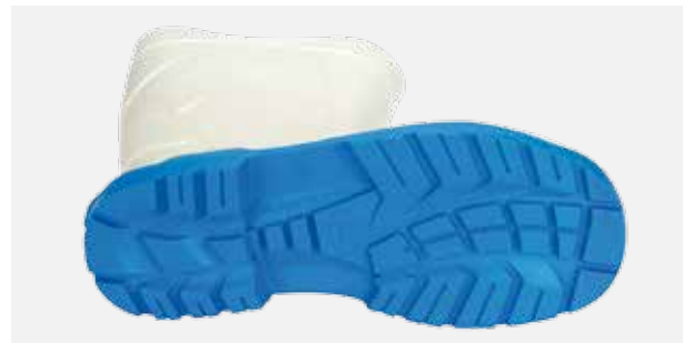
Polyurethane boots, comfort serie (page 18)