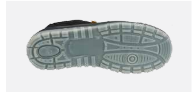
PU/PTU for women (page 14)